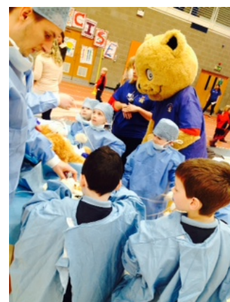
Senior Infants at the Teddy Bears Hospital in U.L.