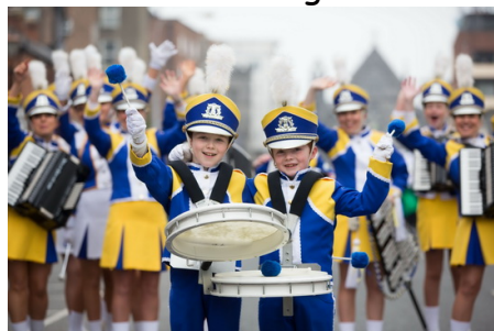
Members of the Band Parade in Limerick

Seachtain na Gaeilge was a great success as always, but let me start off by saying that it was a super fun, happy and a very green week too! The best day for me was the last day, Lá Glas, when everyone in the school dressed up in green! We had a Léim Amach Mór in the yard and everyone tried Irish dancing...but ended up looking more like leprechauns! It was the best week, and we all had great fun learning lots of Irish songs, dances and phrasaí! Go raibh míle maith agaibh to all our teachers and those who organised Seachtain na Gaeilge.